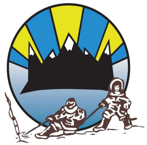
<sup>ፍ</sup> የሥር ፊ ፈር የጋትት የትር ሲ Qikiqtani Inuit Association