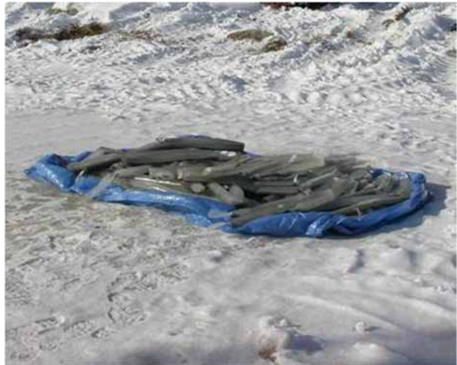
Frozen sausage casings