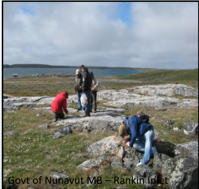
Govt of Nunavut MB – Rankin Inlet