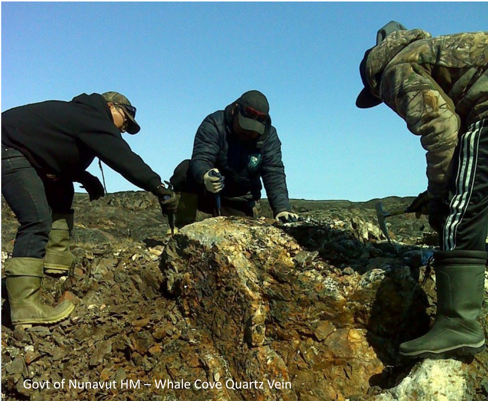
Govt of Nunavut HM – Whale Cove Quartz Vein