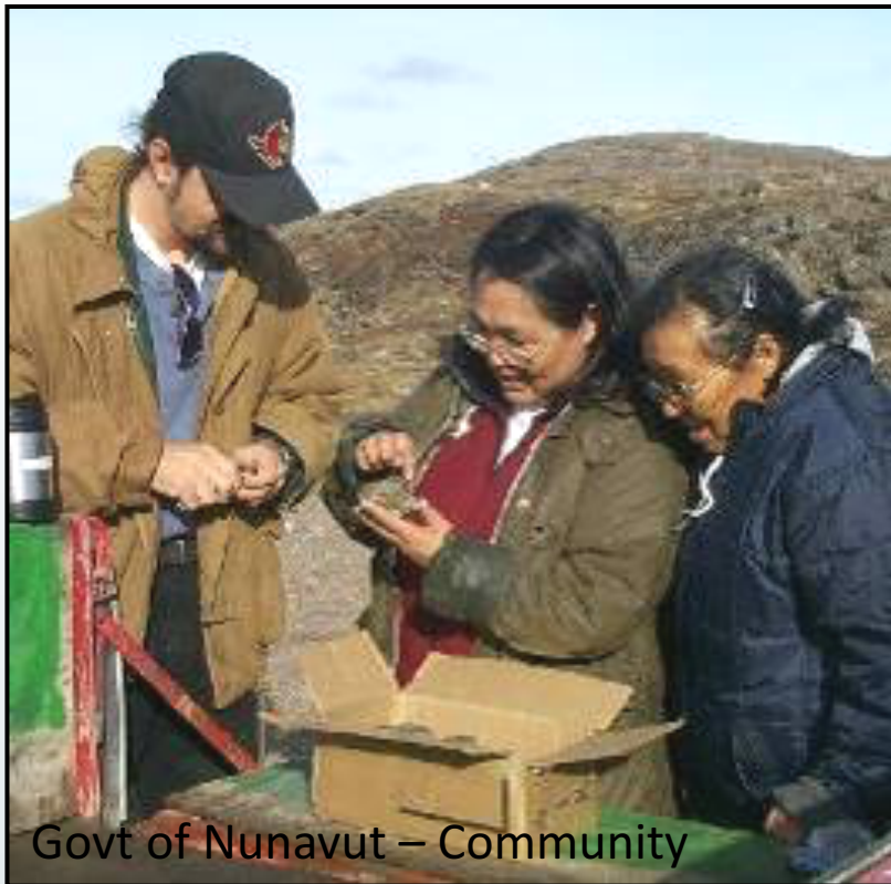
Govt of Nunavut – Community